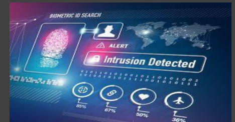
Security & Technology