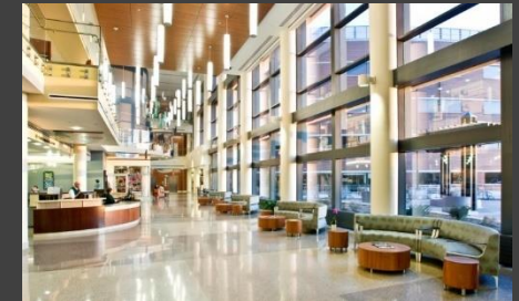
Lighting & Controls