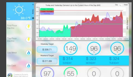
Energy & Commissioning