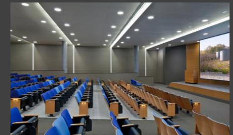
Lighting & Controls