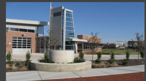
City of Cincinnati, Fire Station #51