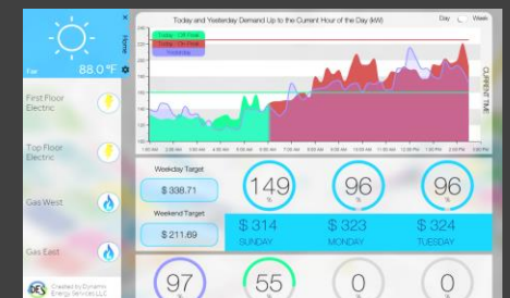
Energy & Commissioning