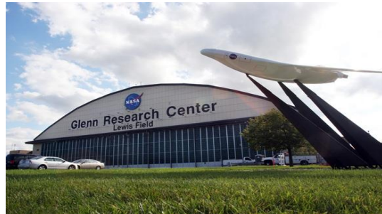
NASA Glenn Research Center, Cleveland, OH

Department of Veteran Affairs: - Aleda Lutz Medical Center - Battle Creek Medical Center - Central Region IDIQ - Cleveland Medical Center - Cincinnati Medical Center - Chillicothe Medical Center - Columbus Medical Center - Dayton Medical Center - Fort Thomas Nursing Home GSA Zone 1 & Zone 2 Engineering IDIQ US EPA, Region 5 Wright-Patterson Air Force Base NASA A/E IDIQ Ohio Department of Transportation Columbus Regional Airport Authority Central Ohio Transit Authority (COTA)