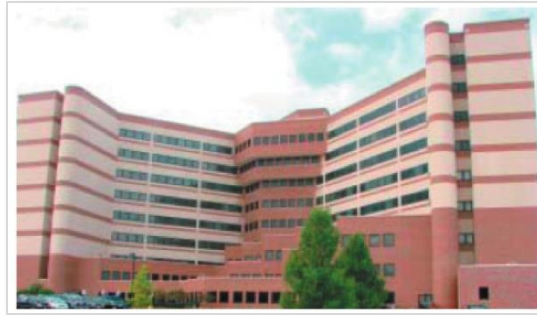
Dayton VA Medical Center, Dayton, OH

Adjutant General's Office Department of Energy Department of Veterans Affairs Department of Homeland Security Environmental Protection Agency General Services Administration National Aeronautics & Space Admin. US Army Corps of Engineers United States Air Force