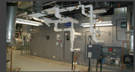
HVAC & Mechanical