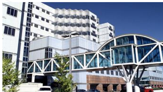
Portland VA Medical Center, Portland, OR