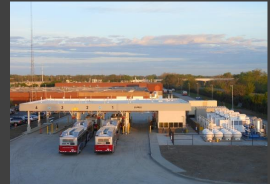
Central Ohio Transit Authority