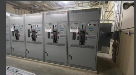
Power Distribution & Generation