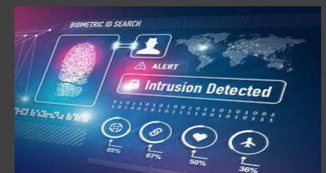
Security & Technology