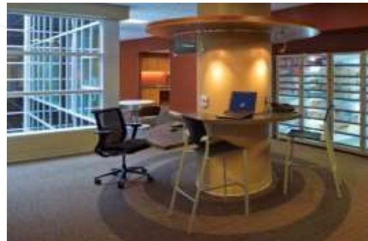
Dublin Methodist Hospital, Dublin, OH