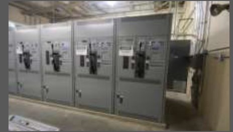
Power Distribution & Generation

Energy Services Division Controls as a Professional Service Dedicated Technology Division Physical Security Specialization Lean Design Process Implementation Value Add Planning