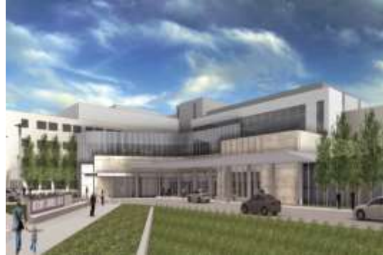
Mt Carmel Hospital, Columbus, OH

Akron Children's Hospital Cincinnati Children's Hospital Nationwide Children's Hospital Mercy Health OhioHealth TriHealth University of Illinois Medical Center University of Chicago Hospital Virginia Commonwealth