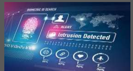
Security & Technology