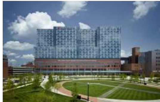
Doan's /Rhoades Infant Security. Ohio State

Data, Voice and video Infrastructure Voice / Video / Conferencing & Data Networking Closed Circuit Surveillance Security & Access Control Systems Smartroom Technologies Fire Alarm, Lighting Systems & Controls Conference Spaces & Specialized A/V Clock Systems Public Safety Intercom Radio Systems (EMS, Telemetry, Paging & Two-way) Power Distribution & Generating Systems Telemedicine & Nurse Call LEED and Sustainability Consulting Master Planning