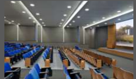
Lighting & Controls