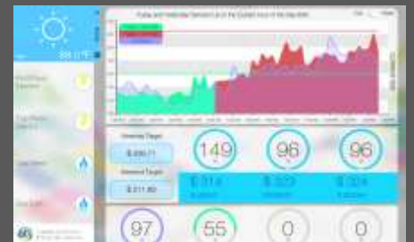
Energy & Commissioning