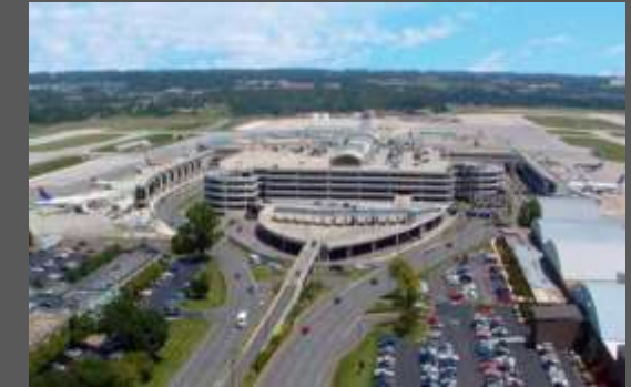
John Glenn Columbus International Airport