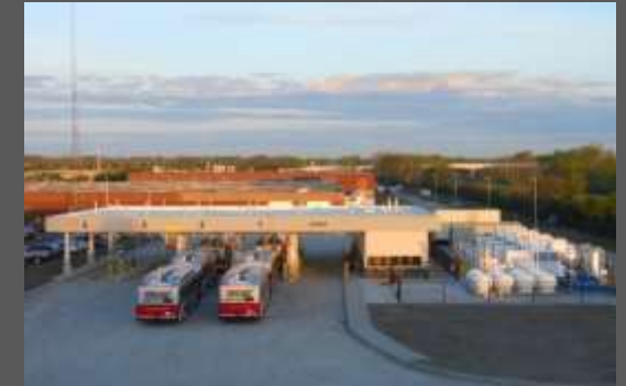
Central Ohio Transit Authority

Professional Engineers (PE) LEED Accredited Professionals (LEED AP) Physical Security Professional (PSP) RCDD OSP NTS RTPM