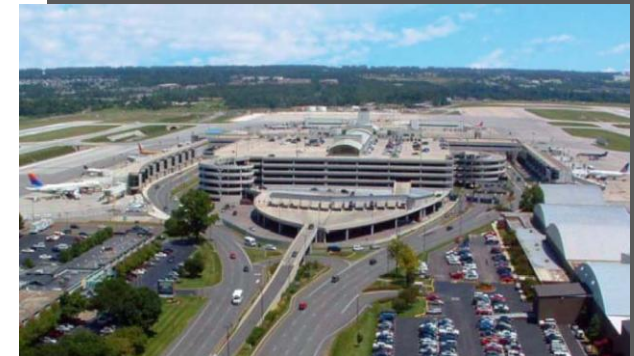
John Glenn Columbus International Airport