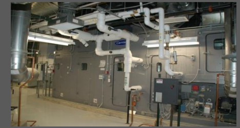
HVAC & Mechanical

Energy Services Division Controls as a Professional Service Dedicated Technology Division Physical Security Specialization Lean Design Process Implementation Value Add Planning