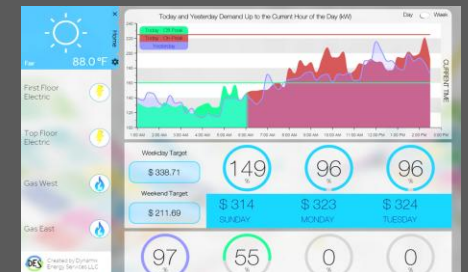
Energy & Commissioning