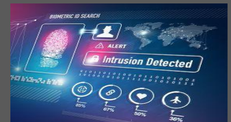
Security & Technology