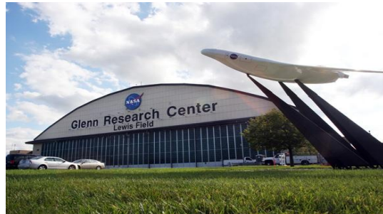
NASA Glenn Research Center, Cleveland, OH

Department of Veteran Affairs: - Central Region IDIQ - Dayton Medical Center - Cleveland Medical Center - Cincinnati Medical Center - Chillicothe Medical Center - Columbus Medical Center - Aleda Lutz Medical Center - Battle Creek Medical Center - Fort Thomas Nursing Home GSA Zone 1 & Zone 2 Engineering IDIQ US EPA, Region 5 Wright-Patterson AFB NASA A/E IDIQ Ohio Department of Transportation Columbus Regional Airport Authority Central Ohio Transit Authority (COTA)