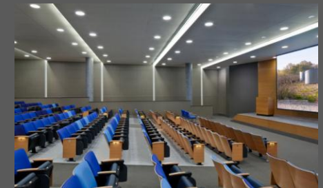
Lighting & Controls